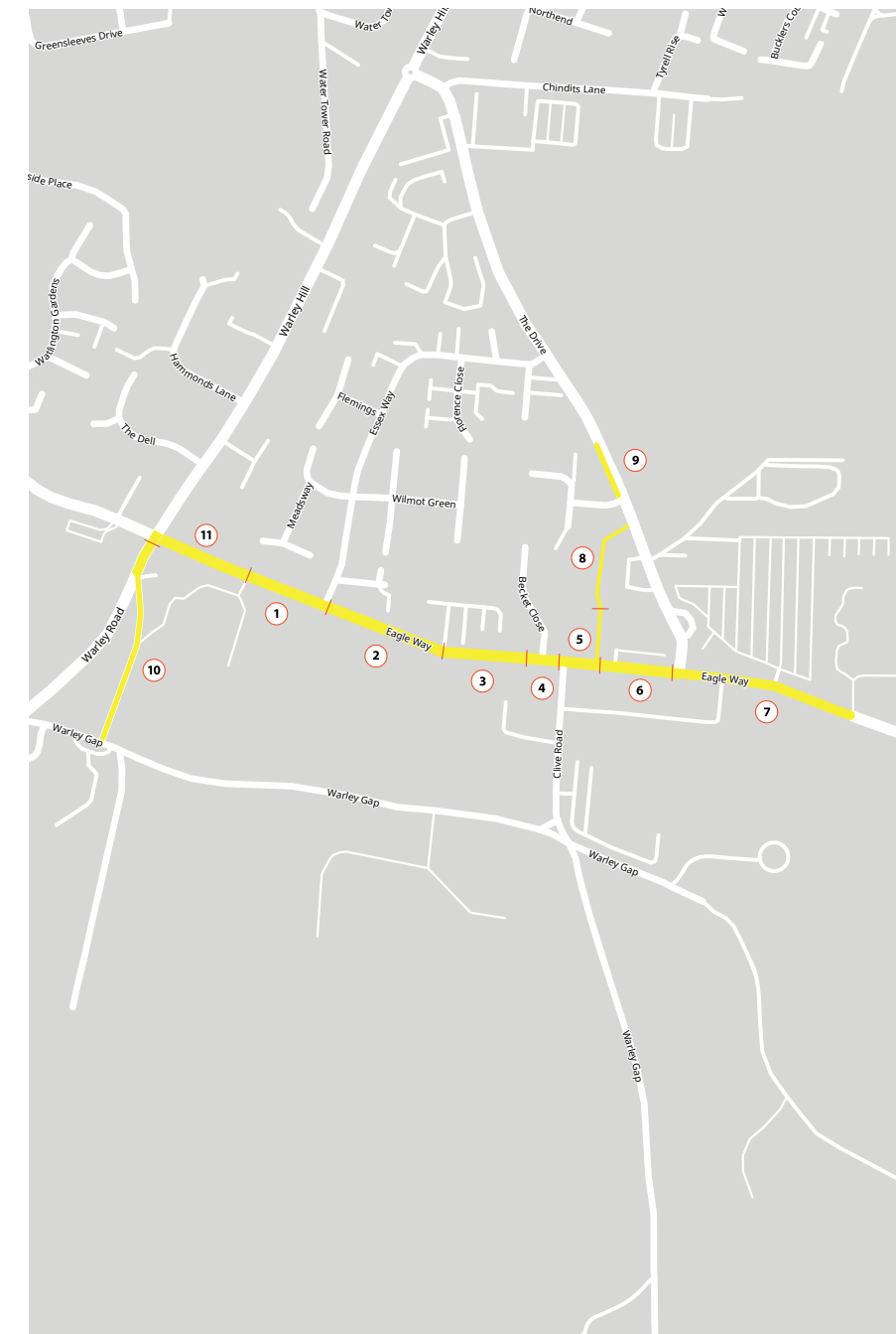
Illustration highlighting where our gas mains replacement work will take place.

Scan code to visit our London Gas Projects information website