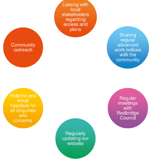
Figure 2 - our community engagement commitments

We will continue working with Redbridge Council and Vision Leisure on our improvement works. Our community engagement commitments are represented below.