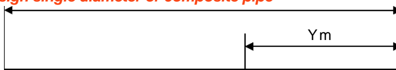
Figure B.1 Design single diameter or composite pipe