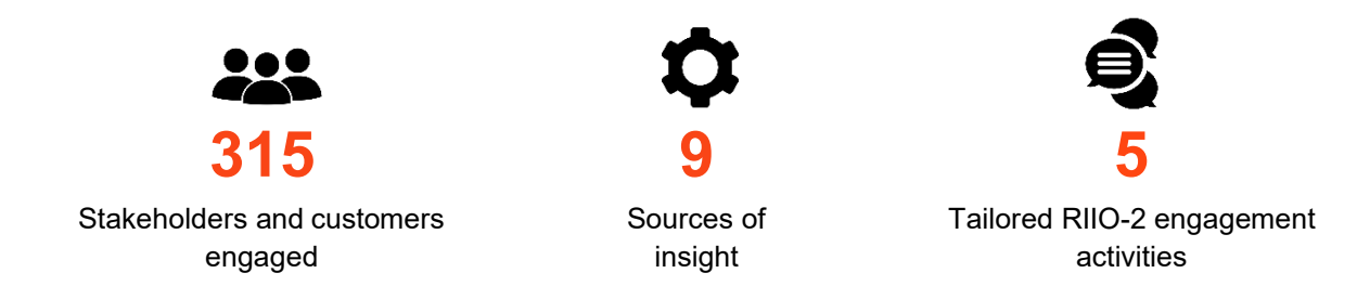
Table 2 Engagement activities