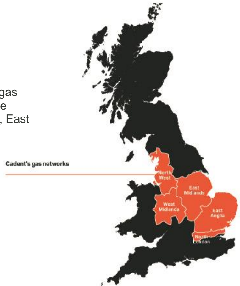
Cadent's gas networks