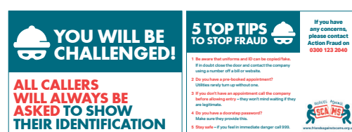
UAS internal door sticker.

We have created customer giveaways to provide tips on preventing scams and these will be sent to customers that are identified as at risk of being a victim of scams. These products include an internal door sticker providing top tips for preventing doorstep scams, which also has an external message warning the scammer that they will be asked to prove their identity. A notebook has also been created for use by the telephone. It details main contacts on the inside page and gives tips on each page.